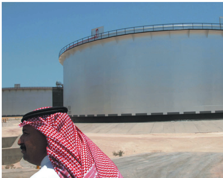
Oil-rich countries such as Saudi Arabia will take decades to reduce their reliance on fossil fuels.

Second, a global mechanism is needed to share information about climate-related investment risk. Investors will be able to plan and make better choices if they know the chances of an asset losing its worth. Financial markets need to be able to judge an energy investment over its lifetime. For