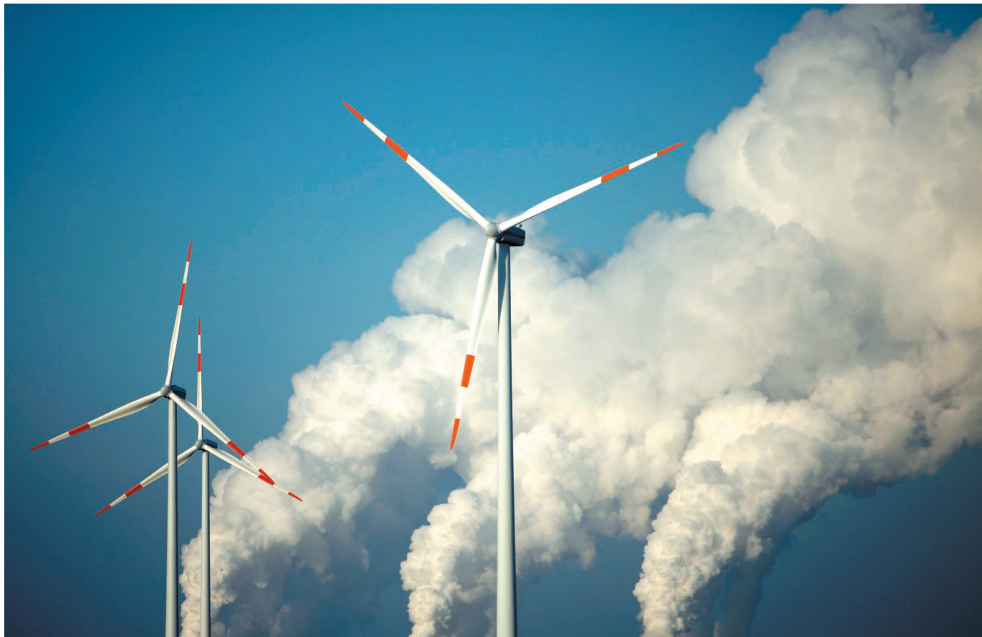
Wind energy and other renewables will replace oil, gas and coal as countries phase out fossil fuels to meet their climate-change commitments.